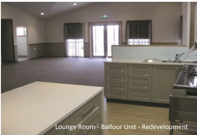
Lounge Room - Balfour Unit - Redevelopment

The Masonic Peace Haven facility was built in 1986 and has served the community well over the past decades. However, the complex is in need of an upgrade to meet more contemporary and community standards and this is especially so in relation to the current dementia-specific Balfour Unit. For a number of years now the lack of en-suites and the out of date design of this unit have made it difficult to maintain occupancy and it has been very apparent that the unit needed an immediate upgrade in order to remain viable.