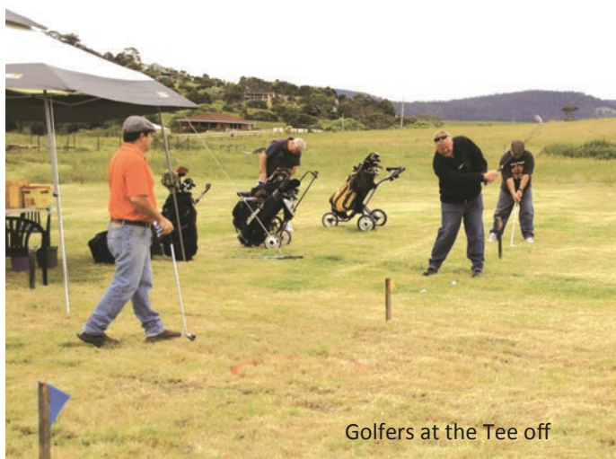
Golfers at the Tee off