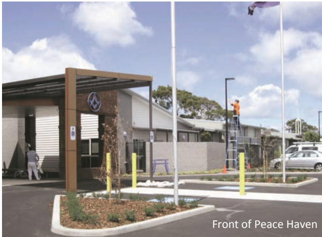
Front of Peace Haven

The Masonic Peace Haven facility was built in 1986 and has served the community well over the past decades. However, the complex is in need of an upgrade to meet more contemporary and community standards and this is especially so in relation to the current dementia-specific Balfour Unit. For a number of years now the lack of en-suites and the out of date design of this unit have made it difficult to maintain occupancy and it has been very apparent that the unit needed an immediate upgrade in order to remain viable.