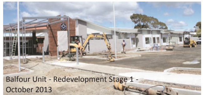
Balfour Unit - Redevelopment Stage 1 - October 2013

The construction contract was awarded to Premium Constructions, who have maintained the project timetable despite inclement weather.