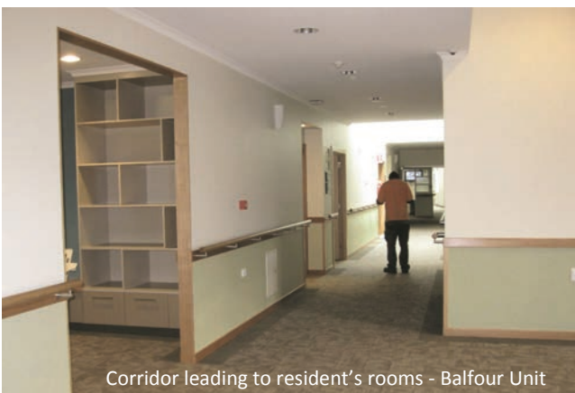
Corridor leading to resident's rooms - Balfour Unit

Stage 1 of the redevelopment programme for the Peace Haven complex, therefore, has begun with the northern section of the Balfour Unit and these building works are expected to be completed by mid-December 2013. This work is being funded from a generous bequest and a Zero