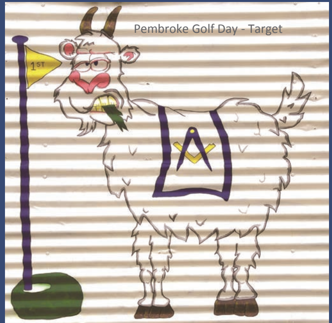
Pembroke Golf Day - Target